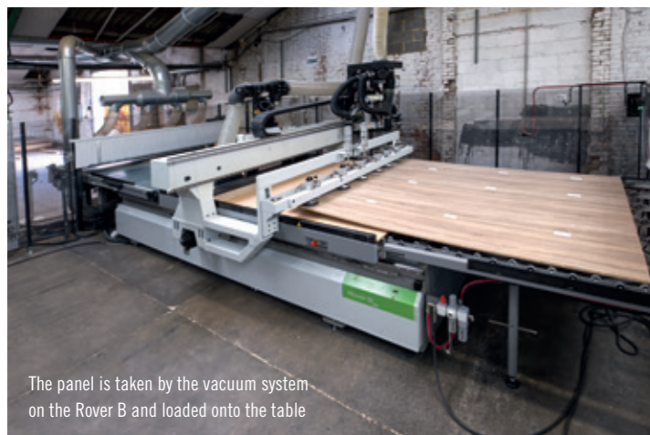
The panel is taken by the vacuum system on the Rover B and loaded onto the table