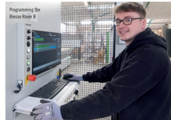
Programming the Biesse Rover B

was delighted with the whole installation: “I think we ordered it in September last year and it arrived in January, slightly earlier than expected. It was installed and commissioned by March and was up and running pretty quickly.