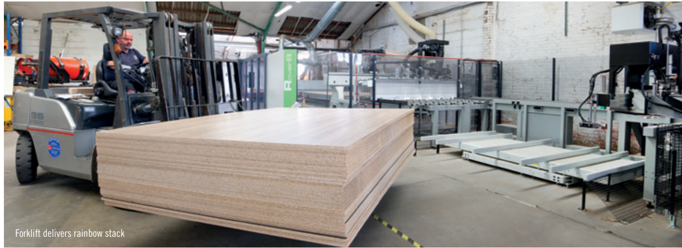
Forklift delivers rainbow stack