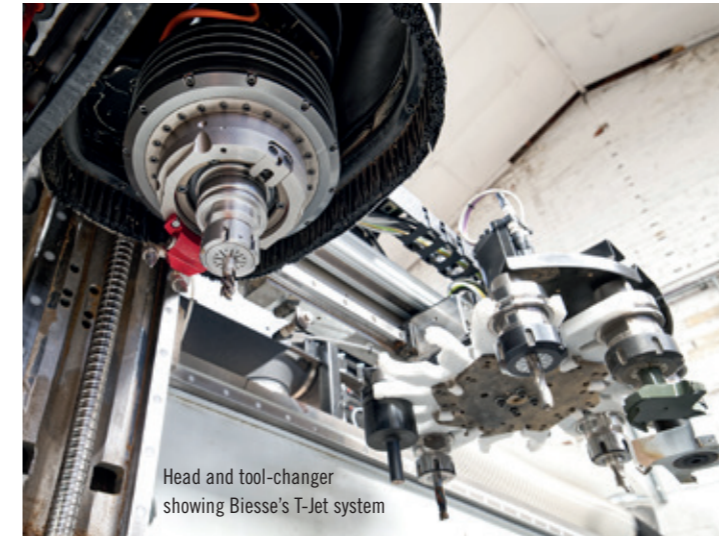
Head and tool-changer showing Biesse's T-Jet system

With such a long history of working with Biesse, it came as no surprise to learn Graeme