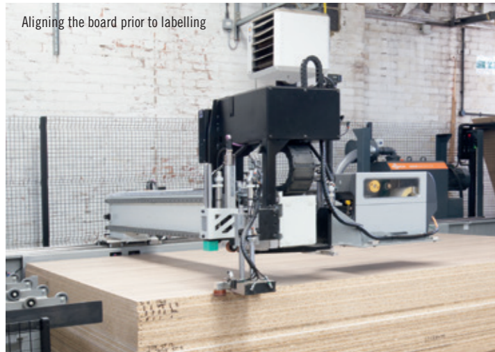
Aligning the board prior to labelling