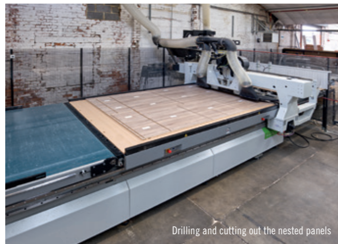
Drilling and cutting out the nested panels

white, five light oak and so on. The stack is put onto the loading system with a forklift.