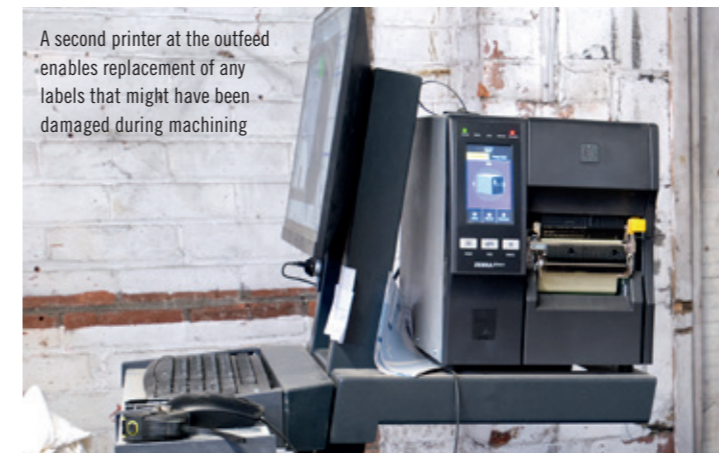
A second printer at the outfeed enables replacement of any labels that might have been damaged during machining