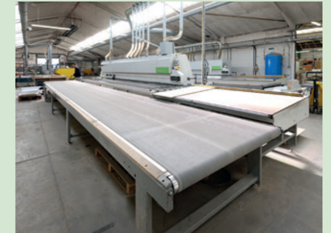
Some of Graeme's previous Biesse machines

For more information on the Biesse Rover B FT HD, call 01327 300366 or visit www.biesse.com/uk/wood/cnc-work-centres/rover-b-ft-hd